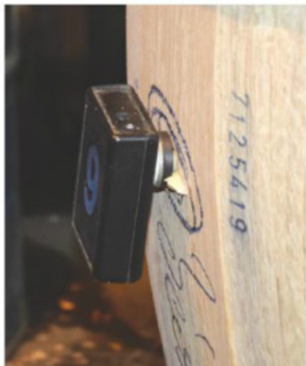
A heat sensor measures temperature inside the staves during the toasting process.

that dilutes the impact of the spring wood, he said.