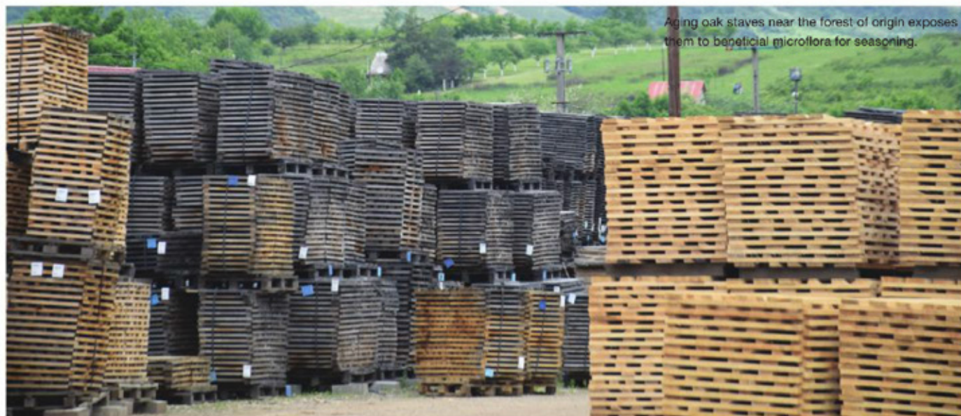
Aging oak staves near the forest of origin exposes them to beneficial microflora for seasoning.

The oak forests and stave mills of Hungary account for only about 4% of world wine barrel production, but the central European country is getting more than its share of attention and acceptance from winemakers these days. That's due to the increasing quality and distinctive flavor characteristics of those barrels, not to mention their moderate prices.